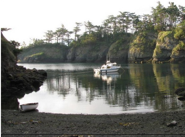
Eagle in secluded cove off Matia Island on a sunny October afternoon.

Source: BoatUS release, Alexandria, Virginia, October 21, 2010